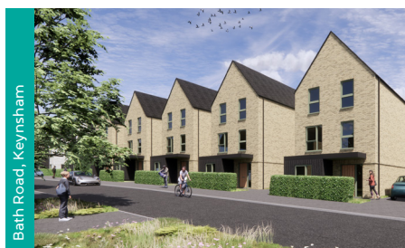
Bath Road, Keynsham

The site will form an extension to Phase 1 (known as Hygge Park in Keynsham), part of which Curo purchased from Crest Nicholson in 2018 and developed a successful scheme of both private and affordable homes.