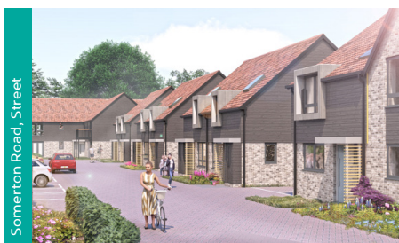
Somerton Road, Street

Scan QR code to take a walk around our Somerton Road development