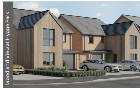
Woodland View at Hygge Park

About: Curo worked alongside national developer Crest Nicholson at Hygge Park, a residential development of 250 homes in Keynsham, where we acquired a parcel of serviced land with detailed planning consent for 56 homes. As part of the deal with Crest Nicholson, Curo also secured all affordable homes across Hygge Park through a S106 agreement.