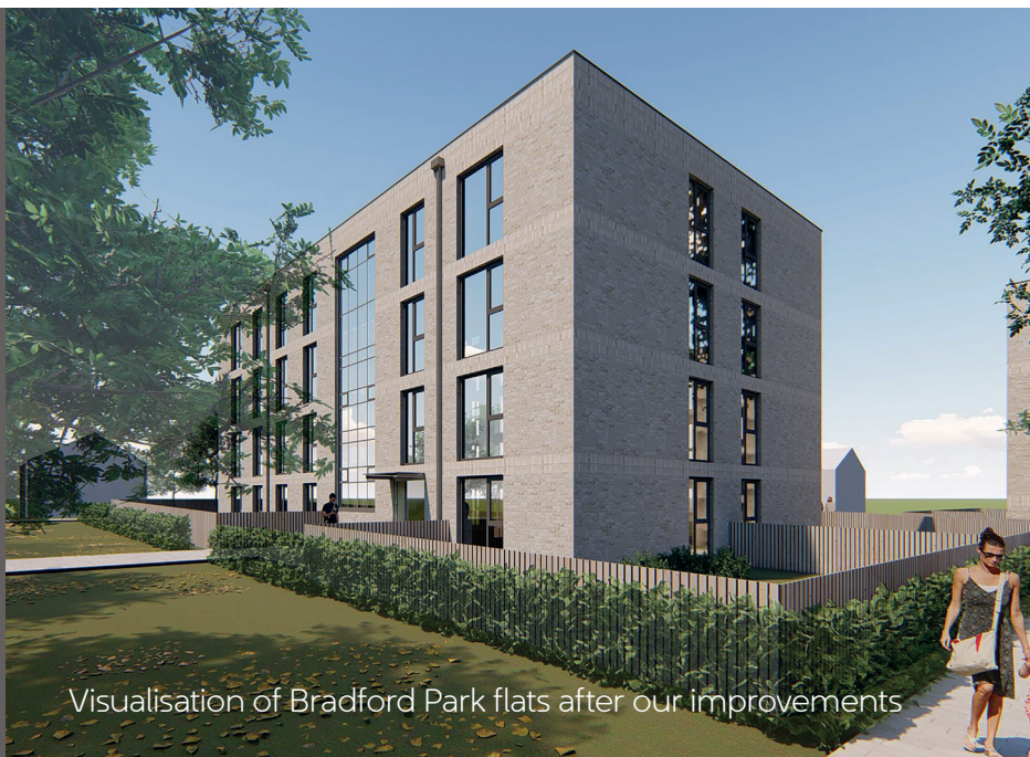
Visualisation of Bradford Park flats after our improvements

The residents that attended generally agreed our ideas were the right priorities.